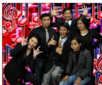
GSE Philippines Talent Show Team

of the talent show, we will be entertained by the Philippine Group Study Musical Team and our musical Team which is currently in the Philippines. What a night we are all going to have!!!