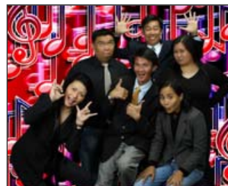
GSE Philippines Talent Show Team